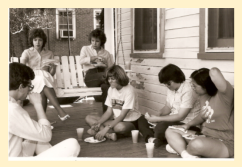
Overflow seating on the porch of a Sunday night meal

Virginia Baptists have purchased, built, and maintained ten Baptist Student Centers across the state since the 1960's. The center at the College of William Mary became the one in greatest need of replacing during the 1980's. The BSU house would often feel too small for Sunday night dinners and other large gatherings.