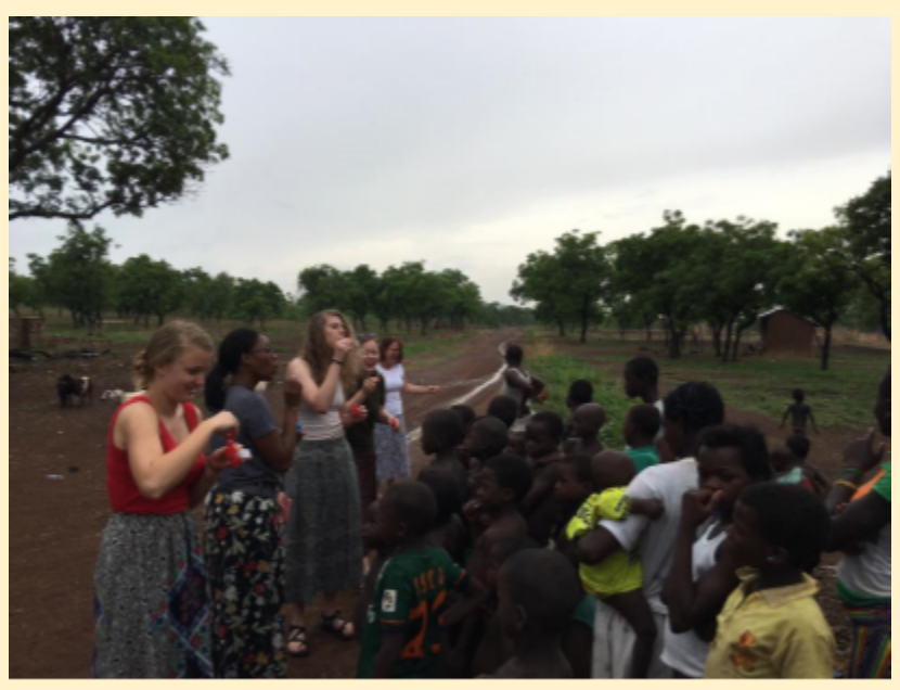
The BCM team in Ghana in May 2016

The BCM has continued being the hands and the feet of Christ in the world, both near and far. In the past decade we have engaged in numerous missions experiences, including helping to rebuild post-Katrina New Orleans; ministry in Jamaica, Costa Rica, and Panama; three trips helping to rebuild post-quake Haiti; and three trips to provide More than Nets in Yendi, Ghana.