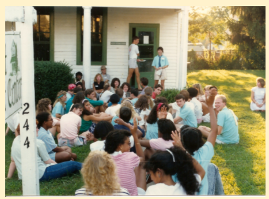
The first gathering outside the BSU Center in 1989