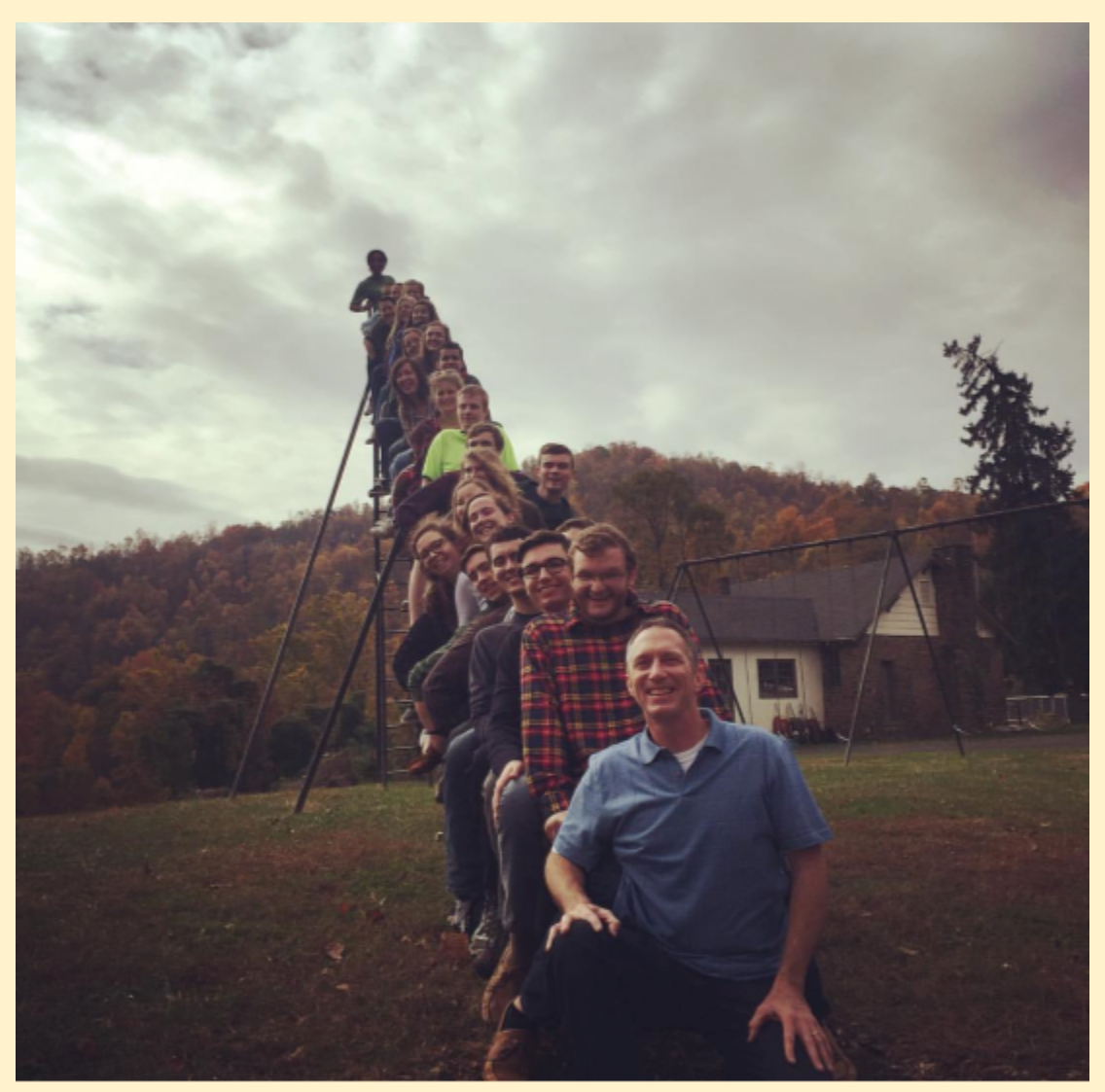
Fall Gathering 2014