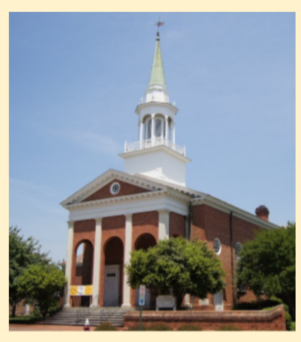
The "new" Williamsburg Baptist Church on Richmond road. Completed in 1934

In 1925 WBC was anticipating an ad- dition to their building "because the State Mission Board had committed $3,000 a year for five years to enlarge the Sunday School to encourage the work with students at the College of William and Mary. In 1926 the commitment was increased to $6,000 a year for five years or a total of $30,000." However, the congregation could hardly afford the basic renovations necessary to its existing buildings beside the Powder Magazine on Duke of Gloucester Street. The church would soon engross herself in the arduous process of negotiating with Colonial Williamsburg for building and relocating to its current Richmond Road location in the years 1928 to 1934.