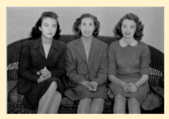
The BSU "group photo" in 1945.

To say that World War II drastically affected life in the United States is an understatement. In 1945, the College of William & Mary had become a woman's college by the looks of the male to female ratio on campus.