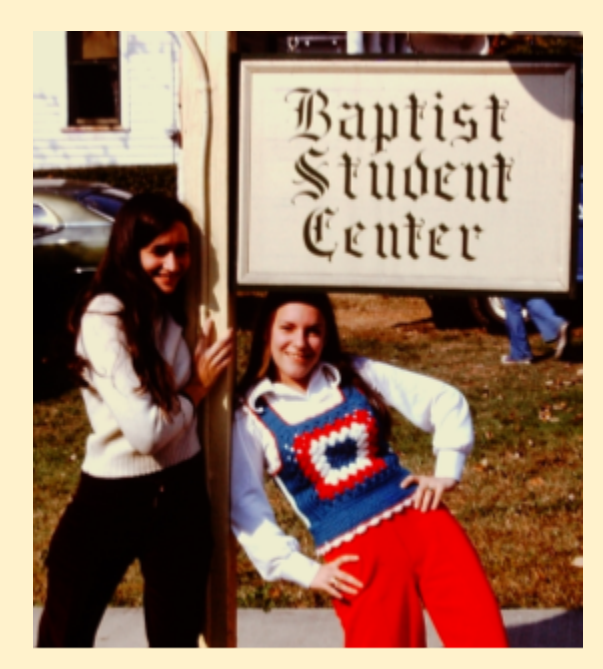
The BSU Center sign