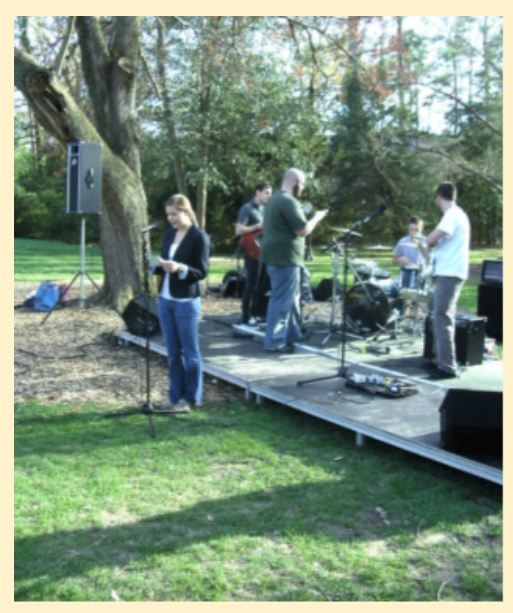
"Love-Hate", an on campus program sponsored by BCM in 2010

We have sent teams domestically to do service in Tennessee, South Carolina, New Jersey, and Virginia. Every year we have students involved in both the Kairos Leadership Initiative and the Kairos Missions Initiative, growing and becoming better leaders and servants for Christ. Finally, we continue the tradition of having students engage in numerous summer missions projects around the world. These cross cultural experiences are ventures in growing a deeper trust in God.