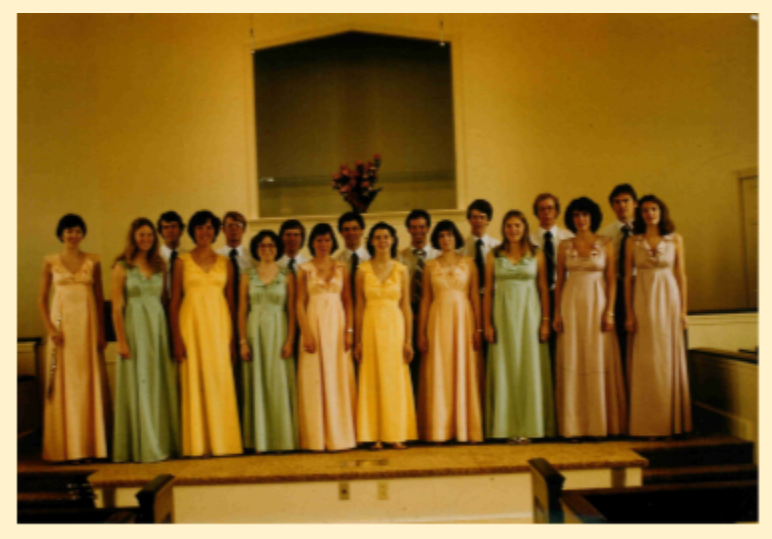
The BSU Choir in 1978

Though Sunday night dinners had been going on for some time, it was in the Fall of 1975 that WMU of the Peninsula Baptist Association began organizing their provision. In the Fall of 1977, student-led Family Groups began for growing deeper Christian community through prayer, Bible study, and fellowship. All three of these traditions continue today.