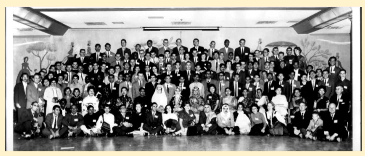
The International Student Retreat was an annual event supported by the BSUs across Virginia. Pictured is the retreat of 1960.