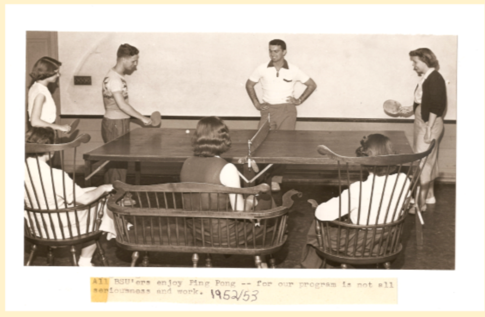
"All BSUers enjoy Ping Pong— for our program is not all seriousness and work."