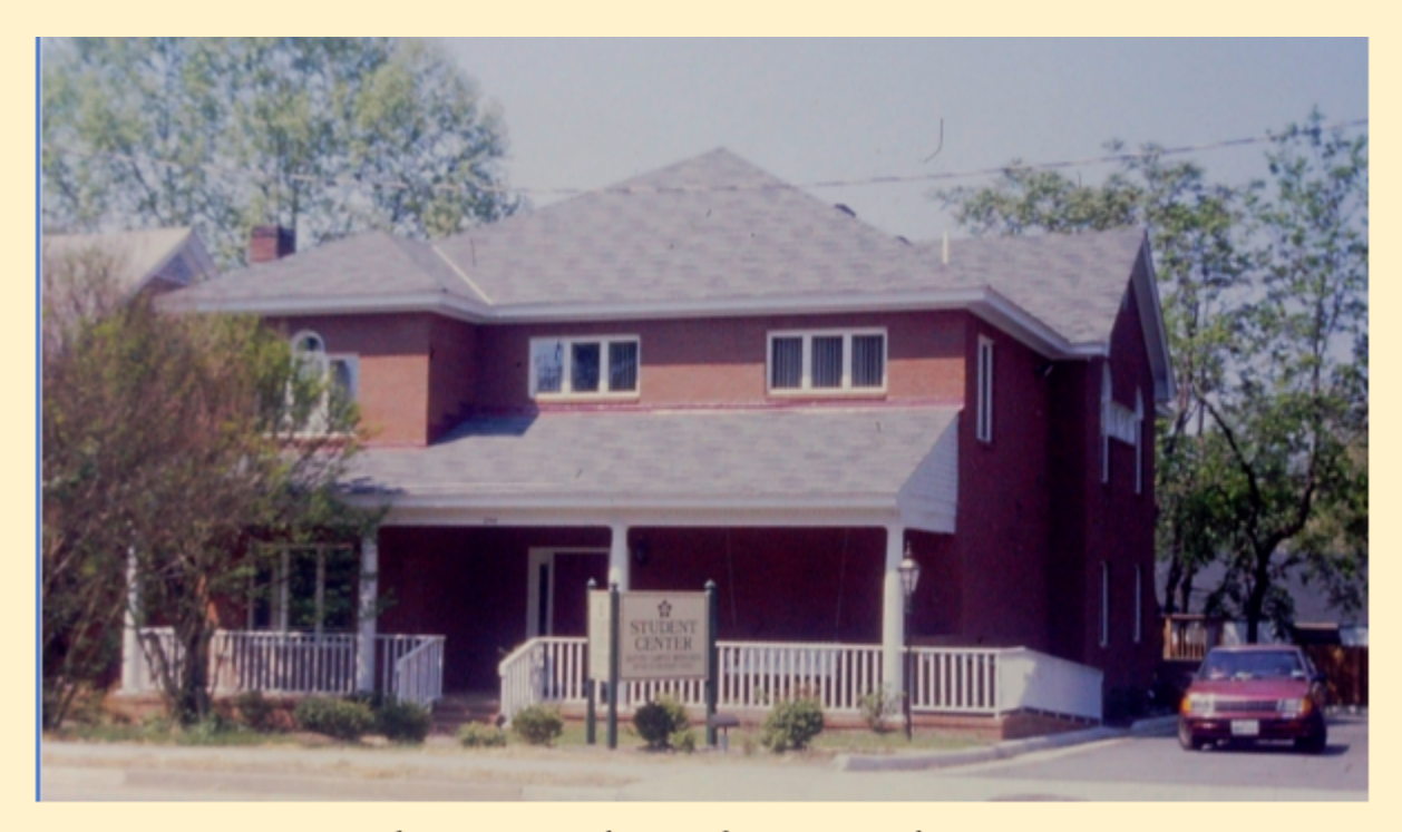
The new Baptist Student Center in 1993